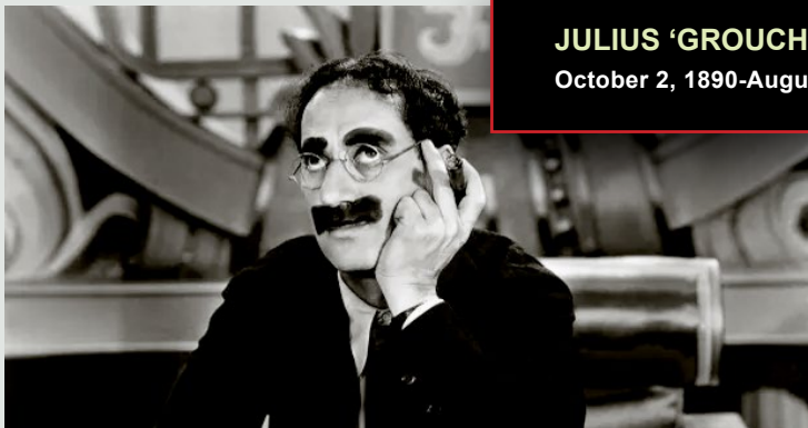
JULIUS ‘GROUCHO’ MARX October 2, 1890-August 19, 1977

“A fool and his money are soon elected.” ~ Kinky Friedman