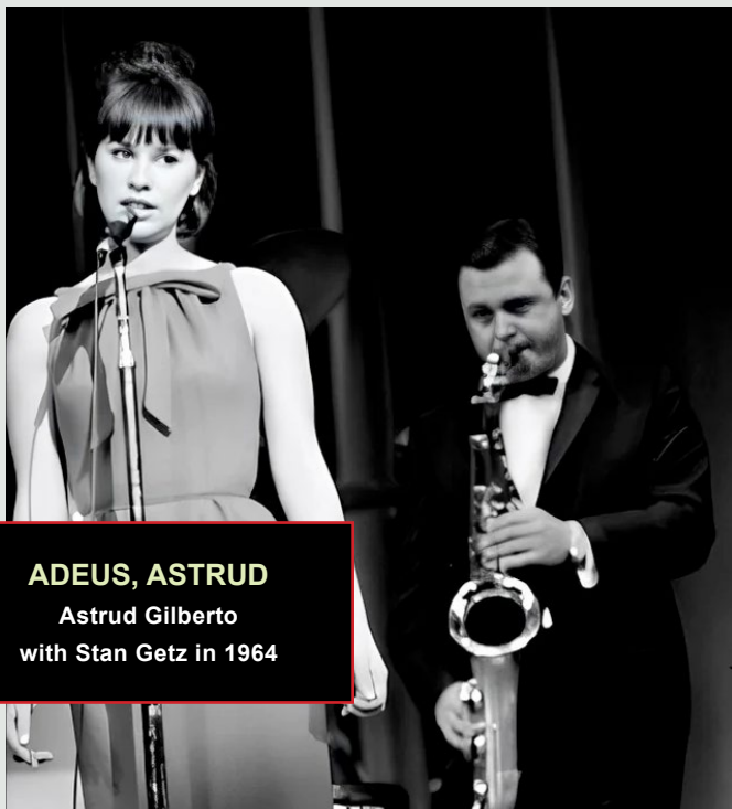
ADEUS, ASTRUD Astrud Gilberto with Stan Getz in 1964

“A bird doesn’t sing because it has an answer, it sings because it has a song.” ~ Maya Angelou