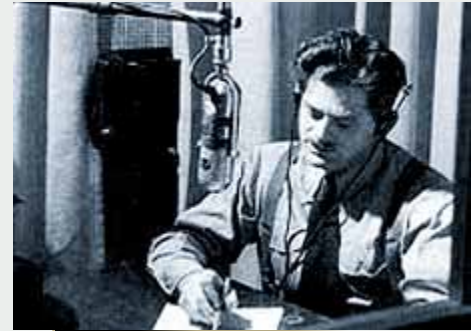
ON THE AIR. Norman Corwin in his element . . . a radio mic, a script, and the audience beyond.