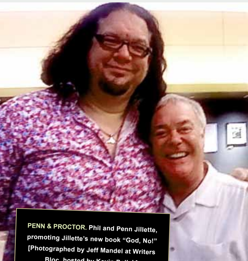
PENN & PROCTOR. Phil and Penn Jillette, promoting Jillette's new book "God, No!"

"After two years in Washington, I often long for the realism and sincerity of Hollywood." ~ Fred Thompson